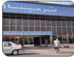
(go to airport)