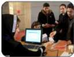
(buy a ticket)